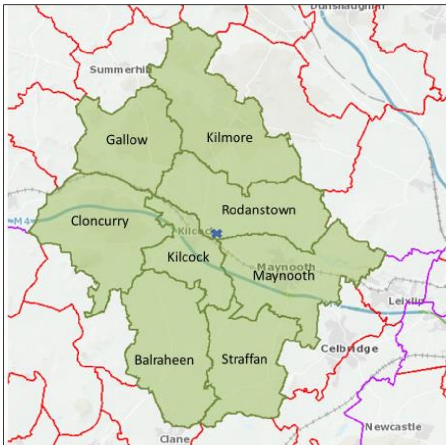
FIGURE 2: ELECTORAL DIVISIONS WITH 5KM OF SUBJECT SITE.