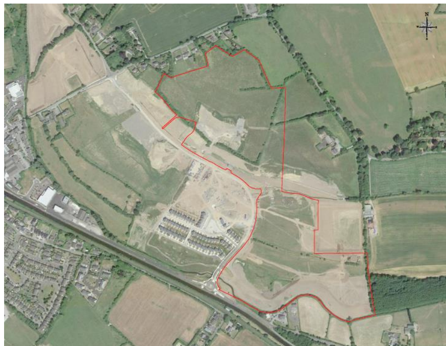
FIGURE 1: LOCATION OF PROPOSED DEVELOPMENT SITE AT NEWTOWNMOYAGHY IN KILCOCK, CO. MEATH.

To support this application McCutcheon Halley Chartered Planning Consultants were appointed to assess the existing childcare provision and capacity proximate to the subject site and to provide an opinion on the need, or otherwise, for a childcare facility to be integrated into the proposed design.